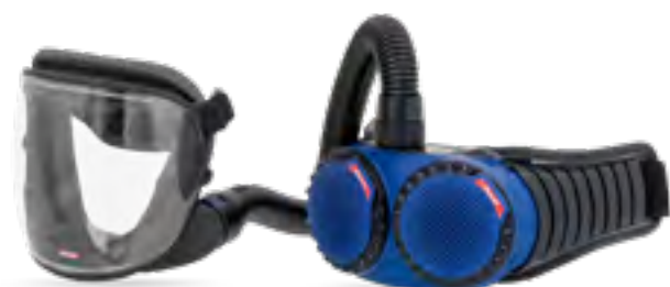
Unimask & AerGO®

The visor has can be easily removed and attached back to the hood. The face seal ensures secure and comfortable fit for the wearer. The face seals can be washed in a washing machine and even dried in the dryer.