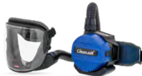
Unimask & Basic