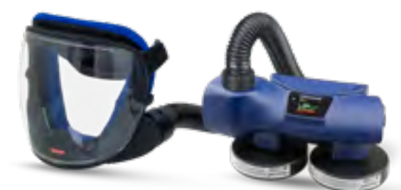
Unimask & Chemical 2F