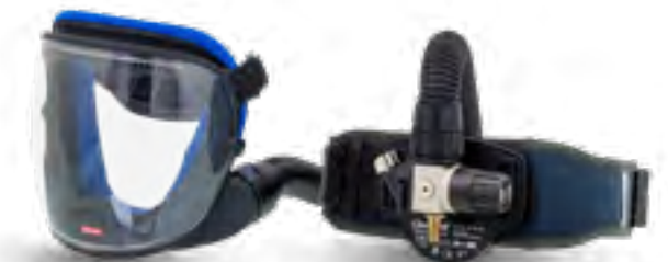
Unimask & Pressure Flow Master