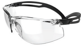
SF501AF-BLK 7100244045 Lens: Clear, AS/AF Frame colour: Black