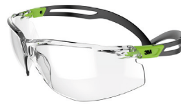
SF501SGAF-GRN 7100243971 Lens: Clear, SGAF Frame colour: Green and black