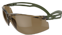
SF505SGAF-DGR 7100244022 Lens: Brown, SGAF Frame colour: Olive green