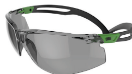
SF530ASP-GRN 7100243989 Lens: IR 3.0 Grey, AS+ Frame colour: Green and black