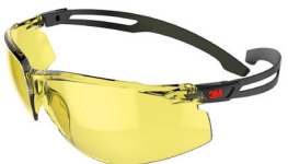
SF503SGAF-BLK 7100243980 Lens: Amber, SGAF Frame colour: Black