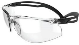
SF501ASP-BLK 7100243979 Lens: Clear, AS+ Frame colour: Black