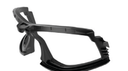
SF500-FOAM 7100243943 Foam gasket accessory

Give them a try – request a sample at 3M.co.uk/SecureFit