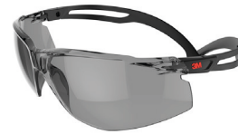
SF507SGAF-BLK 7100243995 Lens: Indoor/outdoor grey, SGAF Frame colour: Black