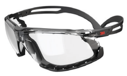
SF501SGAF-BLK-FM 7100243964 Lens: Clear, SGAF Frame colour: Black with foam gasket