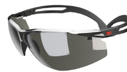
SF509AF-BLK 7100243963 Lens: Silver mirror, AS/AF Frame colour: Black