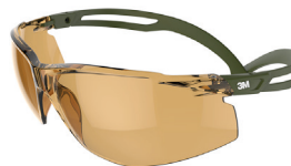
SF528SGAF-DGR 7100244062 Lens: Light brown, SGAF Frame colour: Olive green