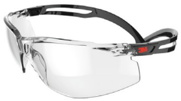
SF501SGAF-BLK 7100243142 Lens: Clear, SGAF Frame colour: Black