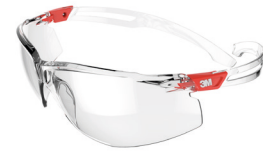
SF501SGAF-RED 7100243934 Lens: Clear, SGAF Frame colour: Clear and red