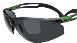
SF550ASP-GRN 7100243978 Lens: IR 5.0 Grey, AS+ Frame colour: Green and black