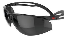
SF502SGAF-BLK 7100244201 Lens: Grey, SGAF Frame colour: Black