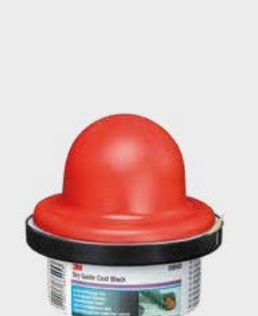
3M™ Dry Guide Coat