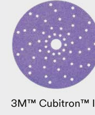
3M™ Cubitron™ II 737U Disc