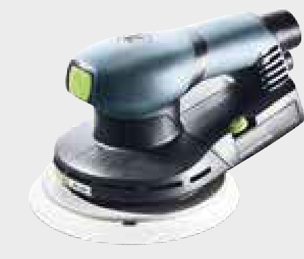
Festool ETS EC 150/5 EQ