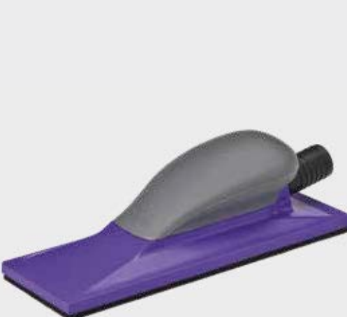
3M™ Hookit™ Purple Hand Block