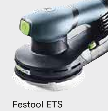
Festool ETS EC 150/3