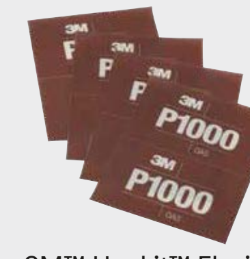
3M™ Hookit™ Flexible Abrasive Sheets