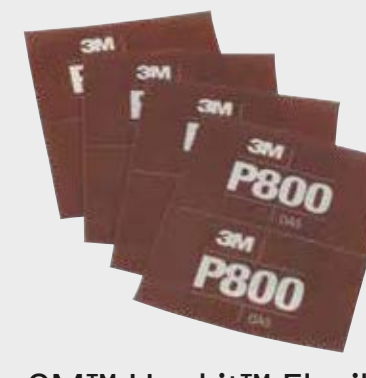
3M™ Hookit™ Flexible Abrasive Sheets