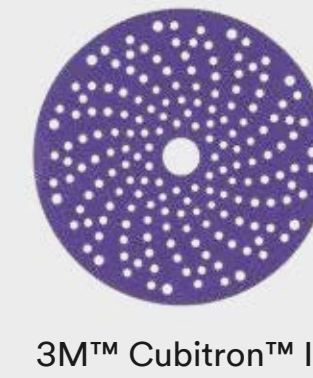
3M™ Cubitron™ II 737U Disc