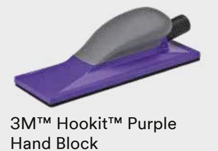
3M™ Hookit™ Purple Hand Block