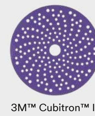
3M™ Cubitron™ II 737U Disc