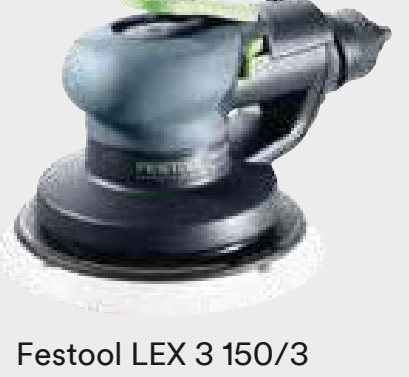
Festool LEX 3 150/3