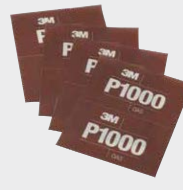
3M™ Hookit™ Flexible Abrasive Sheets