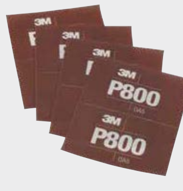
3M™ Hookit™ Flexible Abrasive Sheets