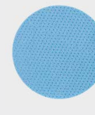
3M™ Hookit™ Flexible Foam Disc