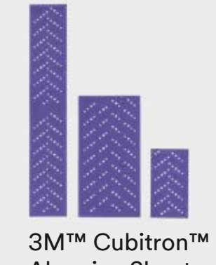
3M™ Cubitron™ II 737U Abrasive Sheets