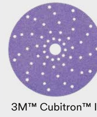
3M™ Cubitron™ II 737U Disc