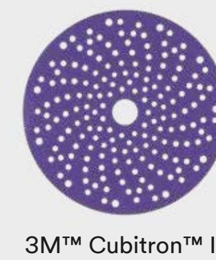
3M™ Cubitron™ II 737U Disc