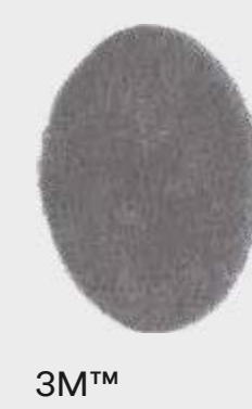
3M™ Scotch-Brite™ Abrasive Discs