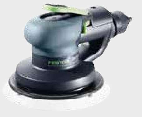
Festool LEX 3 150/5, Festool LEX 3 150/7