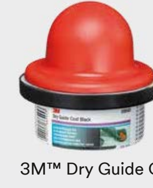
3M™ Dry Guide Coat