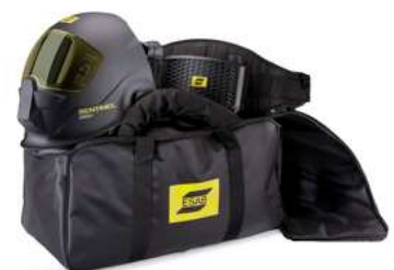
Kit bag available as a accessory item