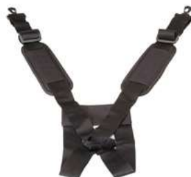
Waist belt shoulder harness