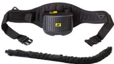
PAPR unit delivered with: Motor unit, Battery, Intelligent charger, P3 filter + Pre filter, Waist belt, Hose and proban hose cover